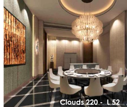
Clouds 220 - L 52