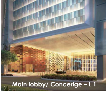
Main lobby/ Concierge – L 1

Arrive And Step Into The World Of Sophistication With its intimate and luxurious décor, main lobby is evocative of the world's greatest hotels.