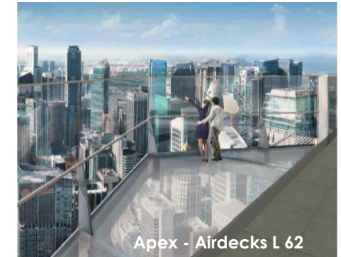
Apex - Airdecks L 62

海拔290米，位于62层的Apex-Airdeck，是这座新加坡最高建筑的最高处。迷人的玻璃悬臂平台为您提供了无可比拟的城市全景。一全新的视角为您展示了城市、大海和天际线的另一种美。